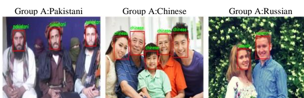
Figure 1. Three groups of different ethnics identified by the system.

As an illustration, Figure 1 shows three pictures of multiple faces. Each picture belongs to a specific group. Three different groups were selected for the test; are Pakistani, Chinese, and Russian-the ethnics of the pictures in Figure 1 predicted with proposed system. Group A shows some people from Pakistan, group B shows some people from China, and group C shows others from Russia.