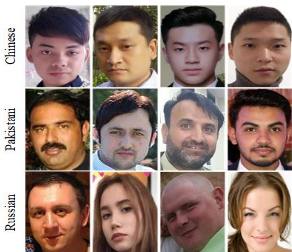
Figure 3. Three different subset images were collected from three different regions. A small part of each group was used as samples in NN4

The model was tested on a new dataset collected from the internet. The test phase shows good results on this dataset. We used a face detector to detect faces and pass each face to the model to extract its features and then pass the features to SVM classifier to predict its ethnicity. It should be noticed that the only drawback in all face studies is the lack of face detection in all previous face detection frameworks, especially for images with multiple faces and multiple poses. This drawback can negatively affect the results because some faces cannot be detected and therefore cannot be predicted in the proposed system. Figure 4 shows some samples of three tested groups in the collected dataset, i.e., Chinese, Pakistani, and Russian.