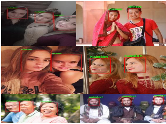
Figure 4. Output samples from the proposed system.